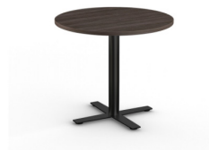
Bar Height 42"