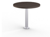
Bar Height 42"