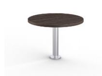
Custom Height: 5" - 42"