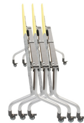
Nested Convertible Tables