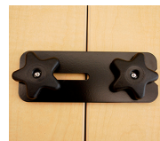
Quick Align Table Connector