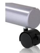
Casters (Except RLX2)