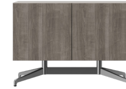
2-Door | 17.5" D x 42" W x 30" H