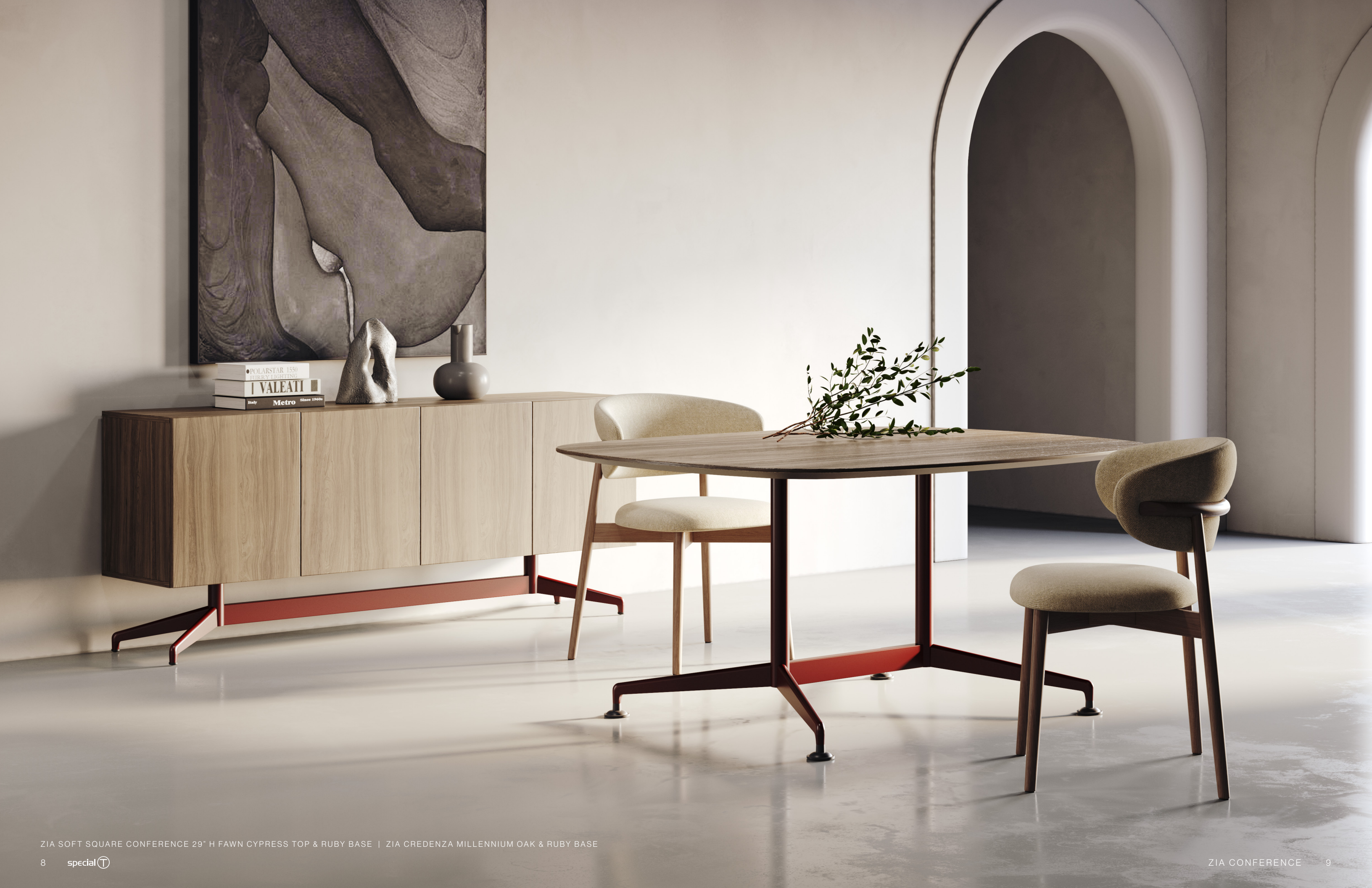
ZIA SOFT SQUARE CONFERENCE 29" H FAWN CYPRESS TOP & RUBY BASE | ZIA CREDENZA MILLENNIUM OAK & RUBY BASE