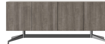
4-Door | 17.5" D x 72" W x 30" H