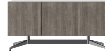
3-Door | 17.5" D x 60" W x 30" H