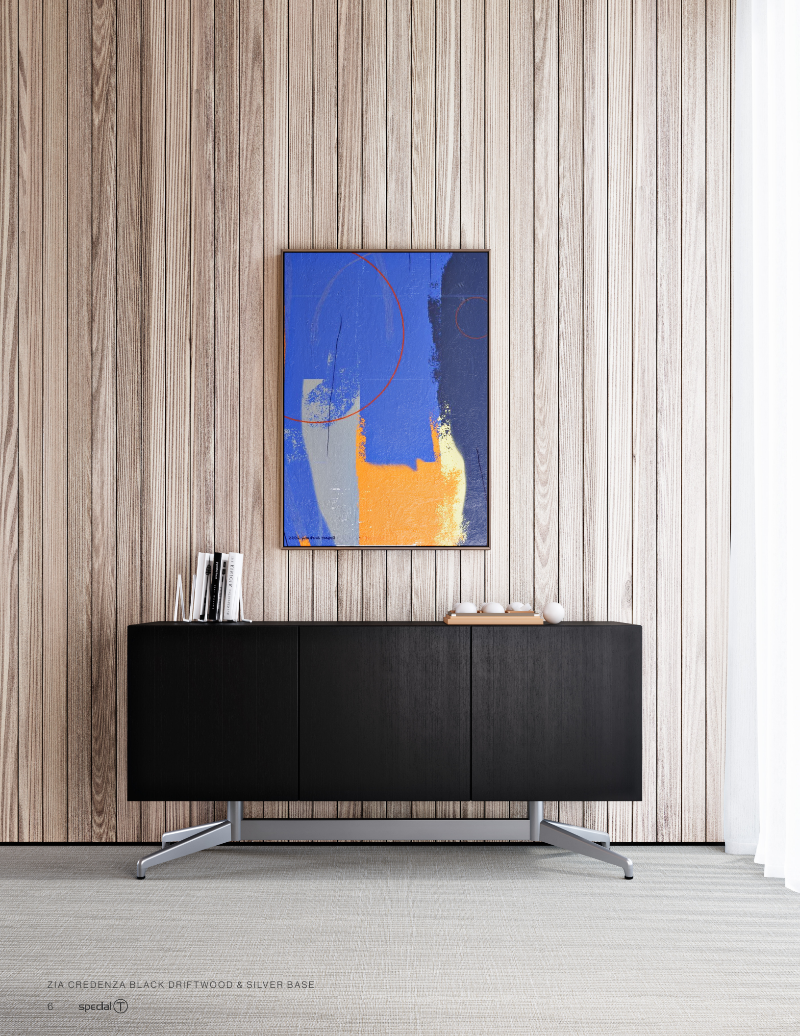
ZIA CREDENZA BLACK DRIFTWOOD & SILVER BASE