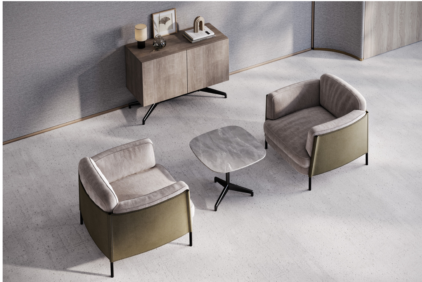
ZIA CREDENZA CERUSE GRAY WALNUT