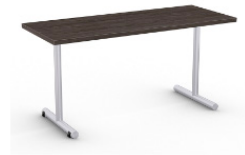
Custom Height 5" - 28.99"