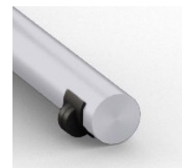
Built-in 1-1/2" Wheel