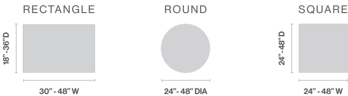
TABLE | HEIGHTS

Designed to maintain nominal table heights independent of glide or caster option.