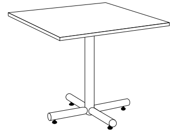
TABLE | SHAPES & SIZES