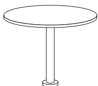
TABLE | OVERALL HEIGHTS