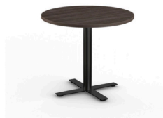
Bar Height 42"