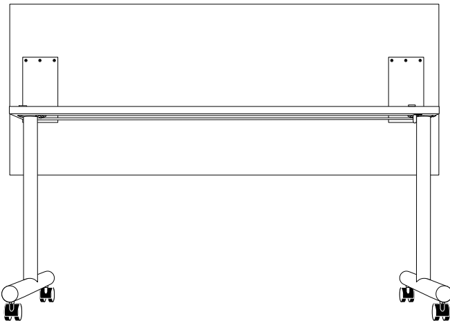
TABLE | SIZES