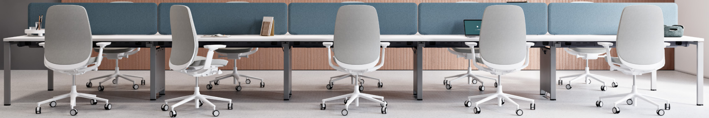
CORE | 10-SEAT DUAL LINE BENCH | WHITE TOPS | METALLIC SILVER BASE | DAINTY FABRIC DIVIDERS