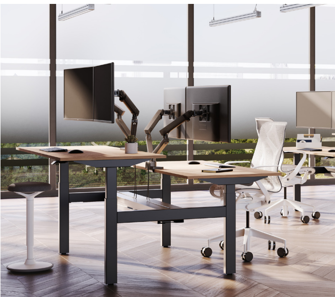
CORE HEIGHT ADJUSTABLE 2-SEAT DUAL LINE BENCH | KENSINGTON MAPLE TOPS | BLACK BASE