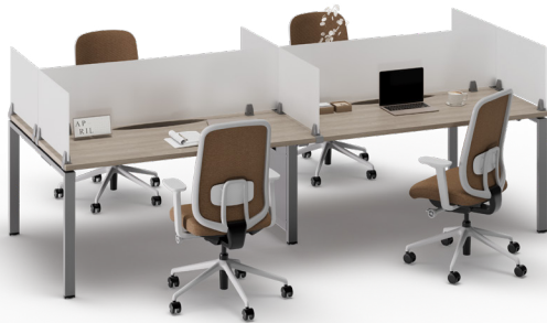
BENCH FEATURING FROSTED ACRYLIC DIVIDERS & RETURNS